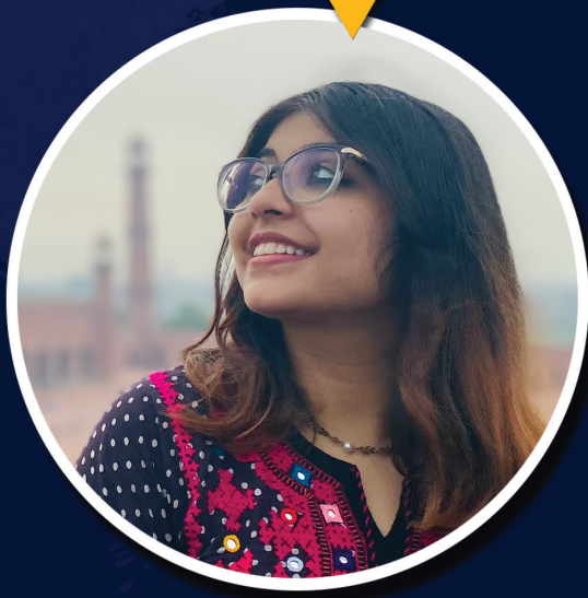
Cornell University Class of 2026

Education Advising at LGS 55 Main aims to guide and facilitate students as they make the transition from school to university. We believe applying to college is an exciting time for self-discovery and exploration. We urge you to think of this as an extended research project, where our goal is to provide you and your parents with the advice and information you need as you journey through the process.